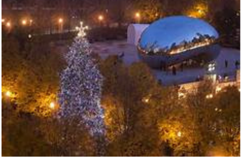
Day 4 - Friday, December 10, 2021

Have breakfast and leave Chicago. Stop for lunch (included) and return to Home by early evening. [B,L]